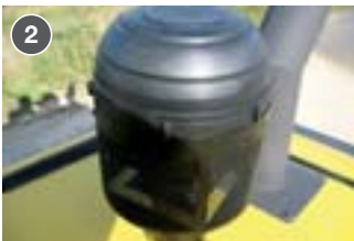
2 ENGINE PRECLEANER WITH SCREEN