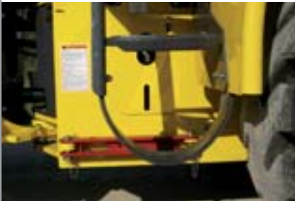
FLEXIBLE LADDER STEP