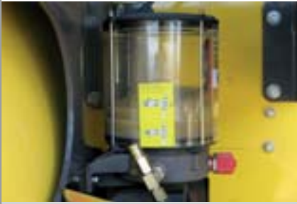
AUTOMATIC GREASING SYSTEM