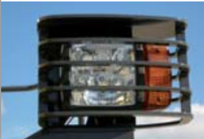
FRONT LIGHT GUARDS