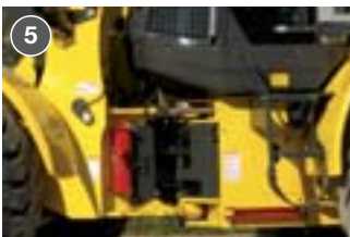
5 ARTICULATION PROTECTION