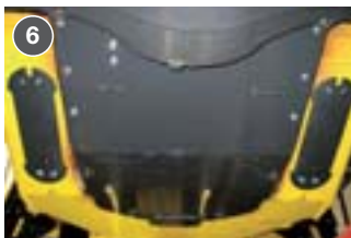
6 BOTTOM GUARD