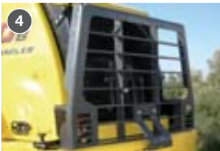
4 REAR GRILLE GUARD