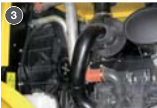
3 HYDRAULIC REVERSIBLE FAN