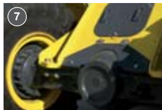
7 FRONT FRAME & AXLE PROTECTION