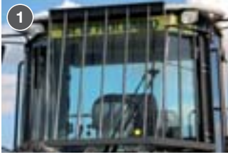
1 FRONT GLASS CAB PROTECTION